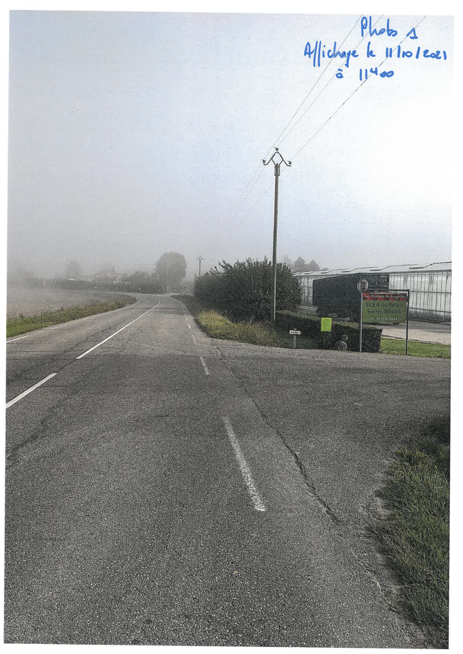
Photo 1 Affichage le 11/10/2021 à 11h00